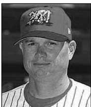
Mike Shildt St. Louis Cardinals